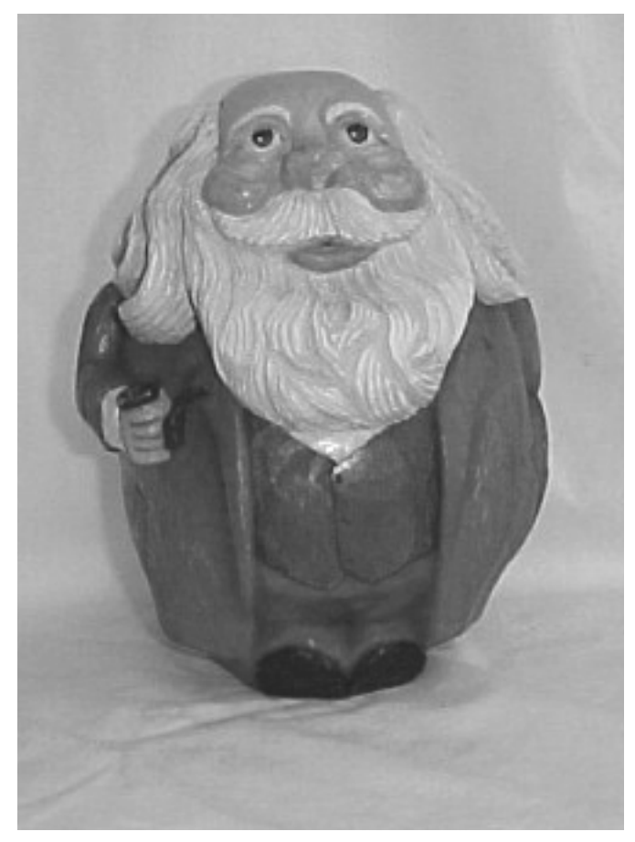
Prairie John's Santa Egg