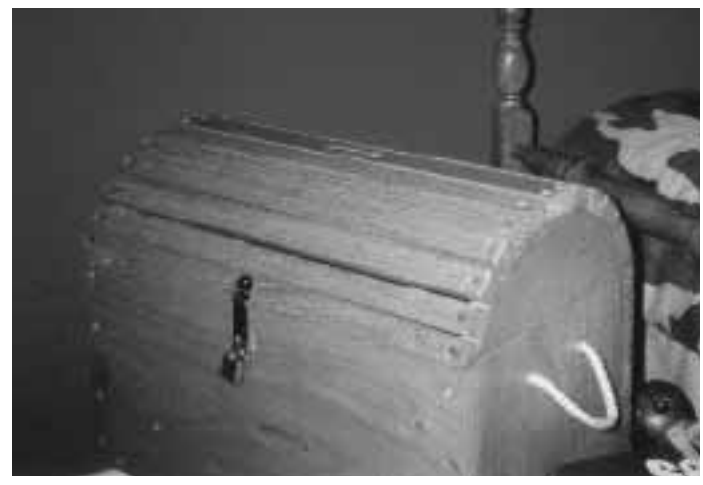
Paulownia toy box made by Robert Davis 2003

etc.) for my granddaughter's bedroom; boat paddles; roll-out shelves for all cabinets in our house, and small items such as birdhouses, picture frames, and trivets. I have found Paulownia wood to be easy to work with. It is very light; easy to sand and get a good smooth finish; takes stain well; and after drying, it remains very stable.