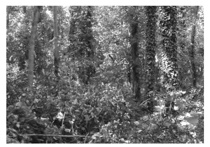
English Ivy Damaging Valuable Paulownia

The final subject area, for which I have yet to experience as a grower of my own crop, is the harvesting and subsequent marketing of my timber. Be prepared to do much of the harvesting and marketing yourself if you wish to maximize your return on investment. My experience with the harvesting of other forest timber has convinced me that there is much