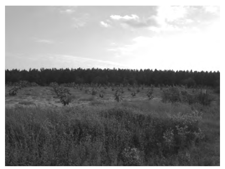
Donaldson Plantation - 1st Year Uniform Planting While I should have been planting another tract, some of these babies still needed suckering, spraying, and intense weed control.

O.K. With the once-coppiced trees and the twice-coppiced trees serving as "trainer trees," the three-times-coppiced trees grew very rapidly, tall, straight, and right up to the only little remaining sunlight left directly above them. Many of you have seen these trees. They appeared to be our Paulownia ideal. They were tall and straight. But their tops were tall and straight as well, and by tops I mean the branched area of the trees where the leaves are located. And you know the leaves are the "stomach of the tree." Since there was little space for leaves to grow and access sunlight,