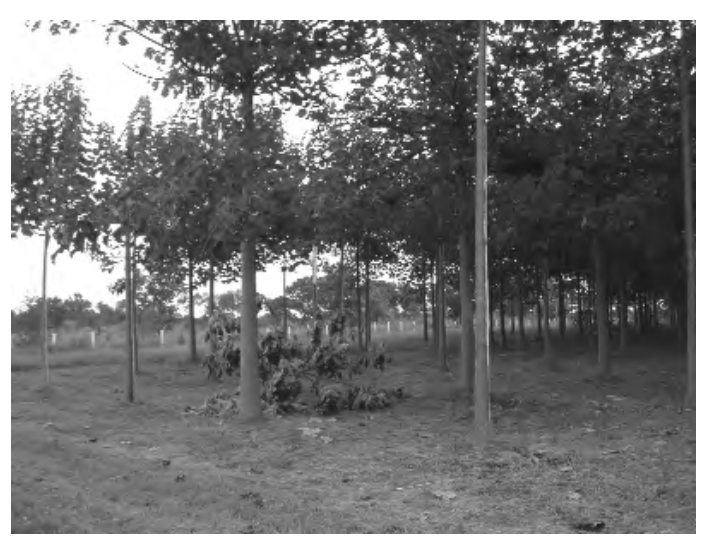
Donaldson Plantation - Broken Tops (4 yr trees) these trees were destined to "fail to thrive." These trees would be the first removed.

4545 Northwestern Drive, Suite C Zionsville, Indiana 46077 Tel: 317-802-0332 • Fax: 317-471-4230