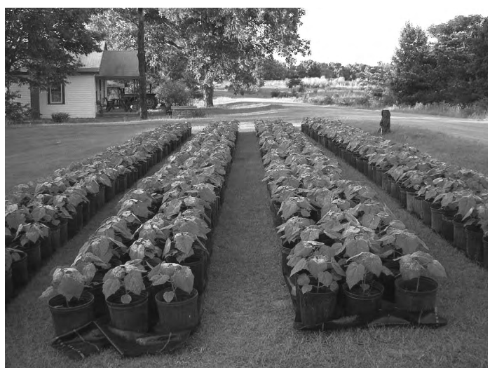
Donaldson Plantation - Uniform Plantlets Ready to Plant require specific care, often unique to the type plantlet. The one thing for sure is that you do not want to rush an immature plant to the harsh field environment. Take the necessary time and precaution to harden the plant off, re-

Plantlet care upon receipt and prior to field planting was another lesson learned for me. Regardless of the plantlet (tissue culture, seedling, or root cutting; green house grown or nursery grown; bare root or potted) all