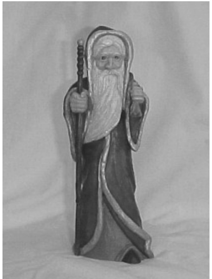
Prairie John's Old World Santa